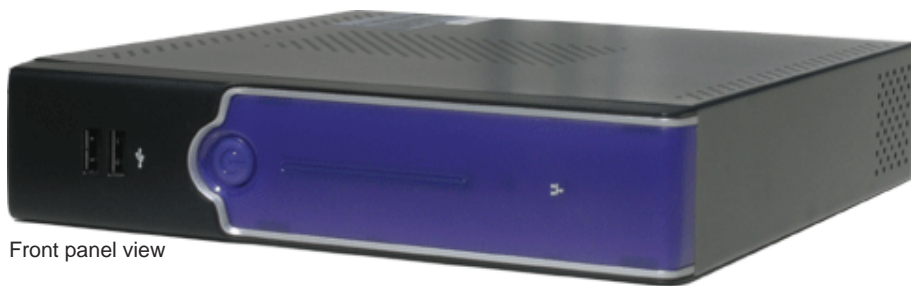
Front panel view

The DMP 6700 (Celeron M) and DMP 6800 (Core 2 Duo) models are powerful but small footprint Digital Signage Media Players (DMP) for network controlled or stand-alone operation via USB stick content loaded. Reliable and robust for 24/7 operation, it can support 2 GB Flash Disk or any 2.5" 44 Pin Slim Line HDD. Supporting a multi zoned payout on a DVI output for a variety of displays such as TFT screens, LCD TVs, Plasma TVs, and Projectors. The DMP Software also supports 90° screen rotation for portrait mode. Content payout such as Videos, Stills, HTML, Flash, News Ticker, within the local network is supported as well as optional extensions for Wireless LAN or TV Tuner via USB port.