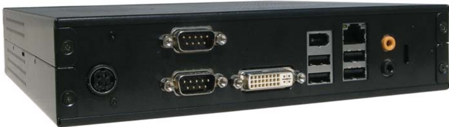
Back panel view